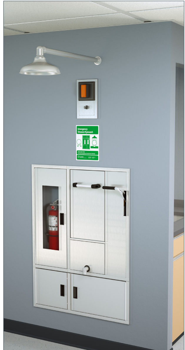
Note: Shown with optional AP280-237 electric light and alarm horn unit with silencing switch. (Fire extinguisher sold separately)

□ AP250-065 Modesty curtain for wall mounting.