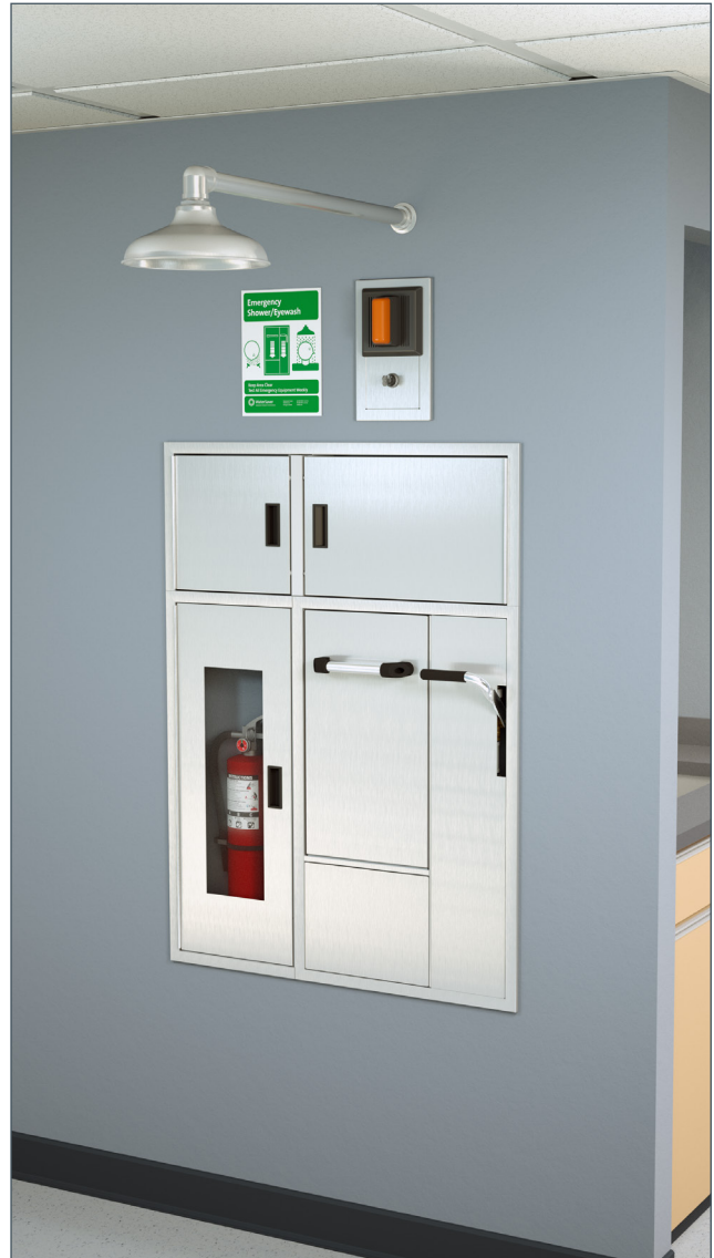
Note: Shown with optional AP280-237 electric light and alarm horn unit with silencing switch. (Fire extinguisher sold separately)