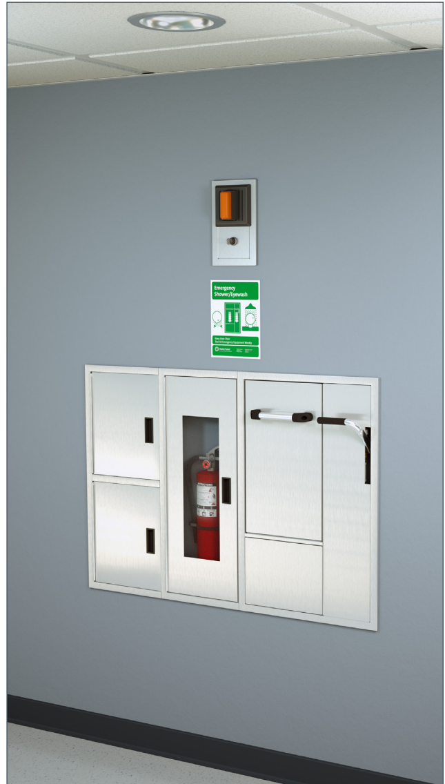
Note: Shown with optional AP280-237 electric light and alarm horn unit with silencing switch. (Fire extinguisher sold separately)

AP250-065 Modesty curtain for wall mounting.