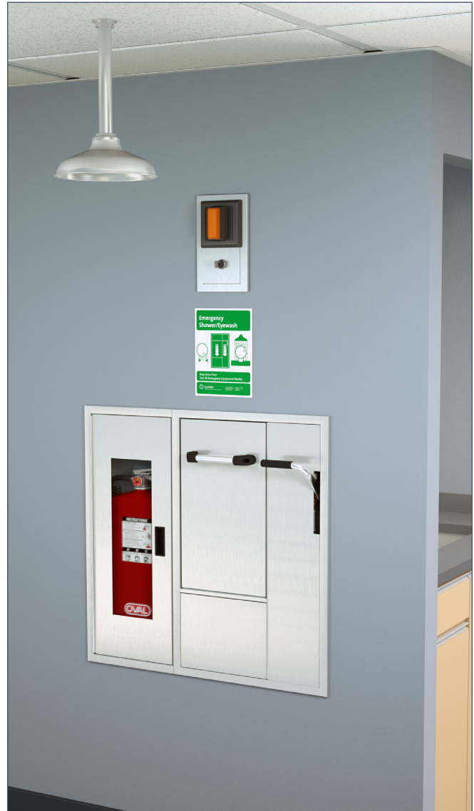
Note: Shown with optional AP280-237 electric light and alarm horn unit with silencing switch. Accommodates Oval fire extinguisher model 10JABC. (Fire extinguisher sold separately)

□ AP250-065 Modesty curtain for wall mounting.