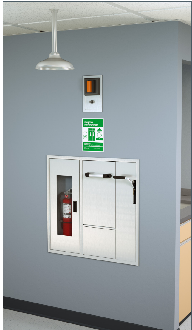
Note: Shown with optional AP280-237 electric light and alarm horn unit with silencing switch. (Fire extinguisher sold separately)