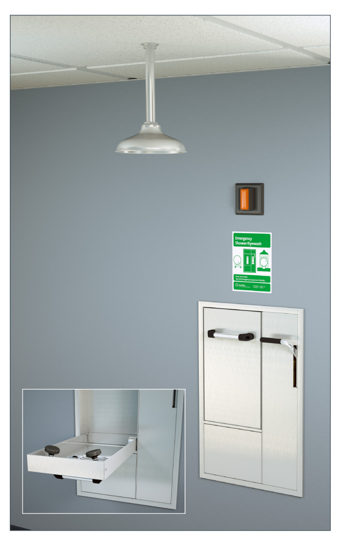
Note: Shown with optional AP280-235 electric light and alarm horn unit (sold separately).