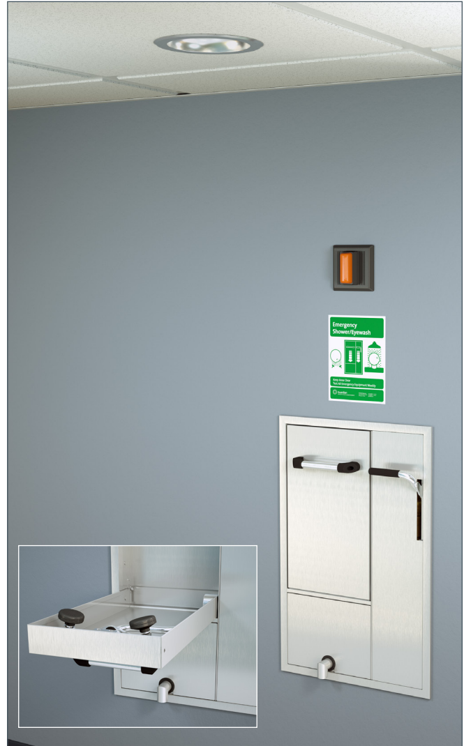
Note: Shown with optional AP280-235 electric light and alarm horn unit (sold separately).

NOTE: ANSI Z358.1-2014 specifies that shower heads be installed no more than 96" above the finished floor. This unit should therefore not be installed in ceilings over 8 feet. For higher ceiling heights, we recommend the GBF2352 or GBF2372 units.