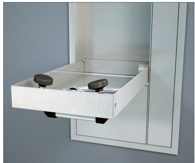
Note: Shown with optional AP285-235 electric light and alarm horn unit (sold separately).